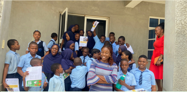
PRIME SCHOLARS SCHOOL