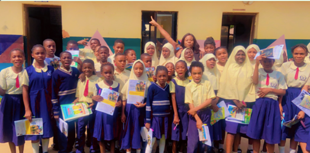
DEGRACIA MODEL SCHOOL