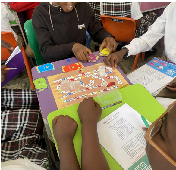
Students at Greenfields Pinnacle School's enjoying the Fun Finance Board Game

One of the most important lessons for children is the value of always striving to be better, no matter how skilled they are. Success comes from continually pushing oneself to improve, and those who learn this early are more likely to achieve great things.