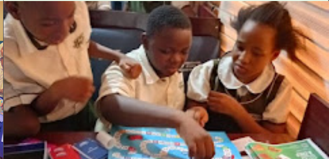
TODDLERS HAVEN AND EVEREST SCHOOL