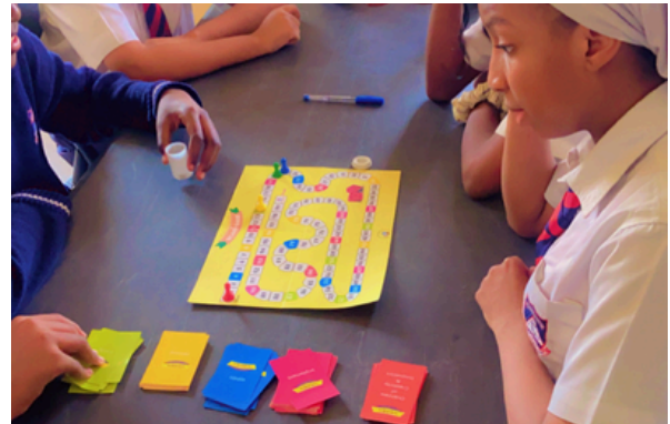
Lightway Academy students learning while having FUN

Self-awareness helps children understand expectations, learn from mistakes, and grow. Discipline teaches balance in work and play, while friendliness fosters strong relationships. Success also comes from continuous learning and resilience in facing challenges. Our storybook, My Big Book of Leadership Stories , shares inspiring tales of African children embracing these qualities.