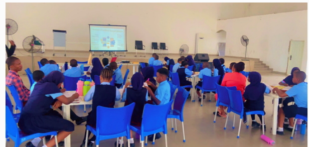
Ethical Financial Literacy Session at Prime Scholars School

Budgeting involves planning your income by prioritizing needs, setting aside money for wants, and saving for future goals while tracking expenses to avoid overspending. The challenge is sticking to the budget, but keeping records, spending wisely, and adjusting when necessary can help. Practicing these habits early builds financial responsibility for managing bigger expenses in the future.