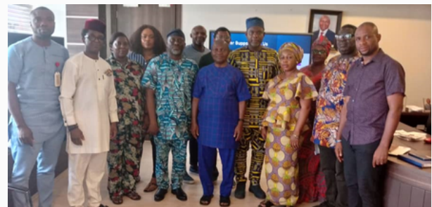
Life Skills Africa delivering a parenting seminar at FIRS, Abuja

From digital payments to kids' savings accounts, Naira sees how banks teach smart money habits. Her story shows that even a single note can make a big difference. The earlier you learn, the stronger your money skills grow. So, what will you do with your money adventure? Remember—smart choices today can lead to big wins tomorrow.