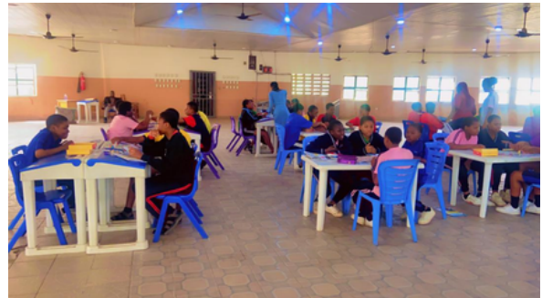
Life Skills Seminar at Anglican Girls Grammar School

By the end of the week, Tobi wasn't scared of change anymore—he had become a change-taming ninja! He learned that change can bring new adventures and chances to grow. So next time your world shifts, take a deep breath and face it with courage, just like Tobi! You never know what amazing things are waiting on the other side of something new.