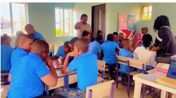
Ethical Financial Habits Session at Hugs and Cuddles School