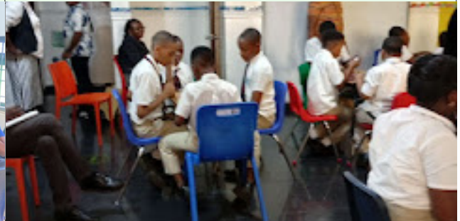
CREATIVE LEARNING INTERNATIONAL SCHOOL