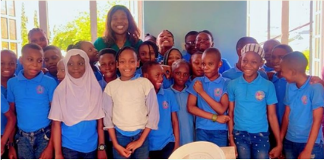
HUGS & CUDDLES SCHOOL