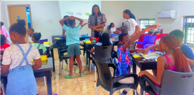
AFTER SCHOOL WORKSHOP