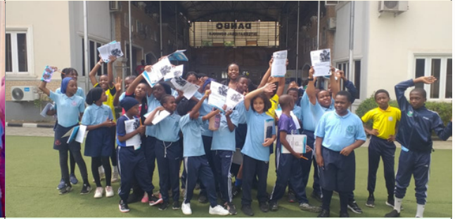
DANBO INTERNATIONAL SCHOOL