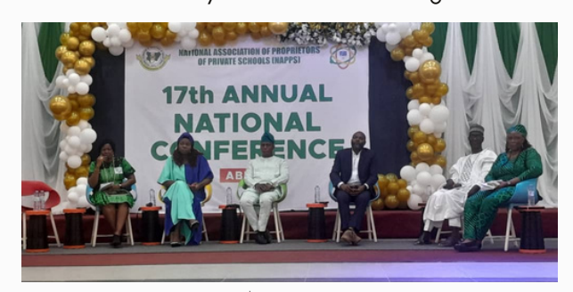
Life Skills Africa as panelists at the 17^{\rm th} Annual NAPPS Conference

So make that smart money move now, learn how to start that business you have been meaning to!