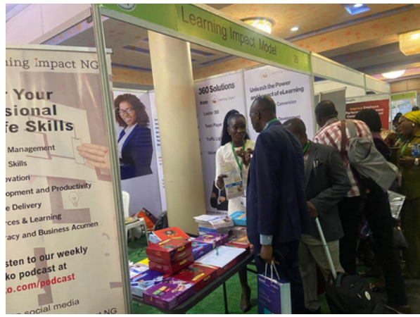
Participants trooping to purchase Life Skills Resources display at CIPM 2024

Great leaders know that focus is key to success. Just like building a tower of blocks, staying focused requires patience, a clear plan, and the ability to ignore distractions. It's not just about avoiding distractions—it's about giving your full attention to the task at hand, no matter how big or small. Whether it's completing schoolwork, leading a team, or reaching a personal goal, being conscientious, determined and resolute about the things you do.